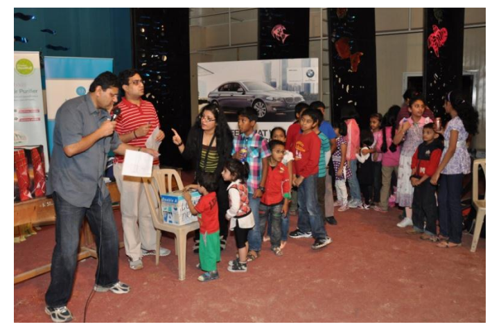
Raffle Draw being picked by kids during annual cricket Fiesta

the event sponsors for their support and praised the good work done by the organizing committee of the event.